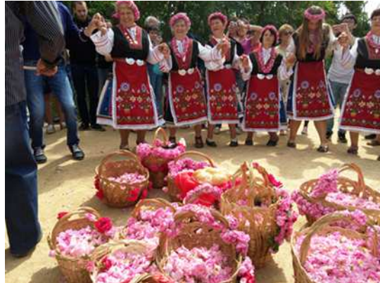
Rose Fields, Kazanluk, Bulgaria

For a detailed itinerary and price please contact me off list, or at my e-mail: ninalk20@hotmail.com .