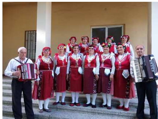
Kalipetrovo group, Bulgaria