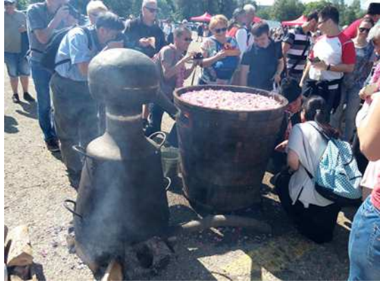
Rose oil distillation, Kazanluk, Bulgaria