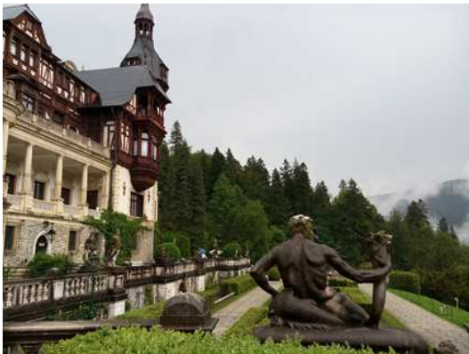
Peles Palace, Sinaia, Romania

I will be leading a 16-day trip to Bulgaria and Romania this spring: May 23 – June 7, 2017. Here are some impressions from my inspection trip earlier this year.