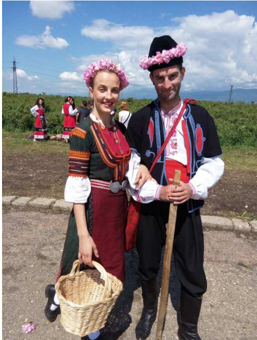
Rose fields Kazanluk, Bulgaria

Trip to Romania and Bulgaria May 23 – June 7, 2017