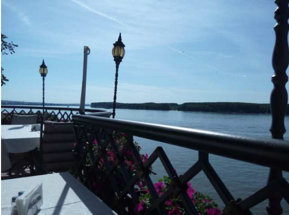
Drustar Hotel on the Danube, Bulgaria

The trip starts in Bucharest and ends in Sofia. We will spend 5 days in Romania and 11 days in Bulgaria.