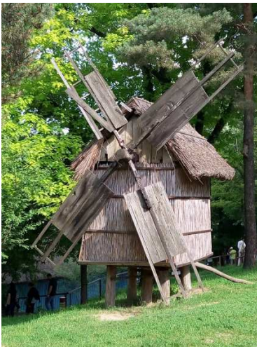
Wind mill, Romania

For a detailed itinerary and price please contact me off list, or at my e-mail: ninalk20@hotmail.com .