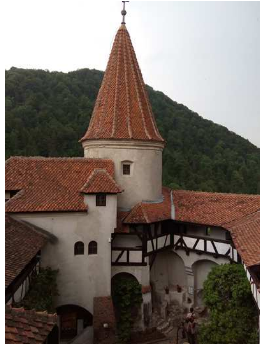
Bran Castle, Romania