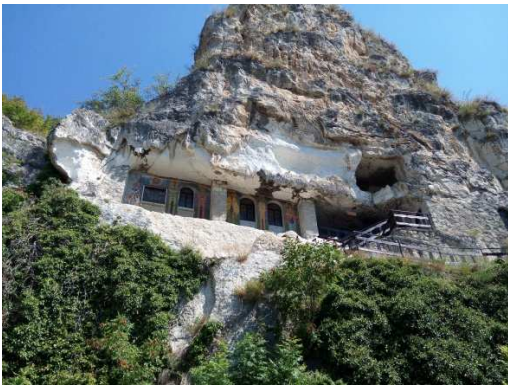
Basarbovsky Rock-Hewn Monastery, Bulgaria

The itinerary includes the Rose Festival and the International Folklore Festival for non-professional dance groups in Kazanluk, village visits and dancing with local groups in Dobrudzha, Bulgaria and Transylvania in Romania, yogurt and cheese making demonstrations, wine tasting, nature walks, castles, fortresses, museums, sightseeing, a spa hotel, to name a few.