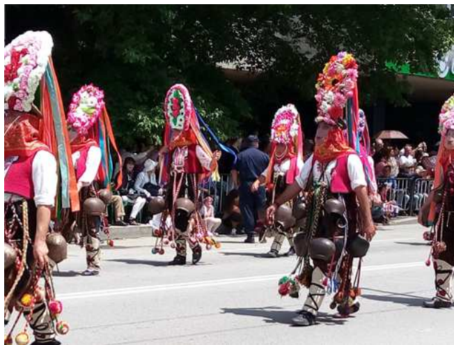
Street parade, Rose Festival, Kazanluk, Bulgaria