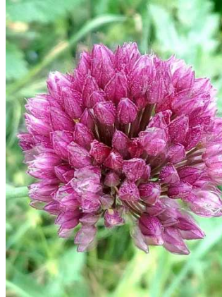
Roussensky Lom Park, Bulgaria

The itinerary includes the Rose Festival and the International Folklore Festival for non-professional dance groups in Kazanluk, village visits and dancing with local groups in Dobrudzha, Bulgaria and Transylvania in Romania, yogurt and cheese making demonstrations, wine tasting, nature walks, castles, fortresses, museums, sightseeing, a spa hotel, to name a few.